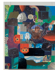
Need Your Help - 2020 24" x 18" Mixed Media