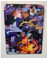
Fritz Zwicky - 2020 24" x 18" Mixed Media