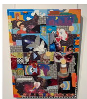
Coming of the White Man - 2020 24" x 18" Mixed Media