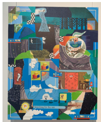
Searching for the Sun - 2020 20" x 16" Mixed Media