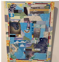
Fogged In - 2020 24" x 18" Mixed Media