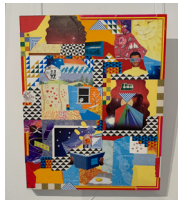
Back in Time - 2020 20" x 16" Mixed Media