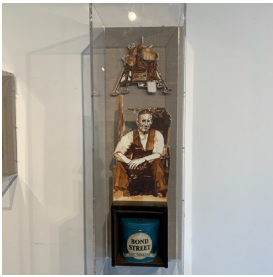
Mr. Bond - 2018 28" x 9" x 7" Aluminum, Copper, Cast Iron, Mixed Media Acrylic