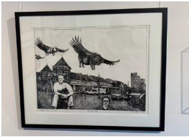
When Pigs Fly - 2018 18.5" x 24.5" Ink Paper Drypoint