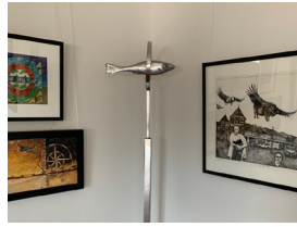
Fish Through Hoop 16" x 13.5" x 76" Aluminum Metal