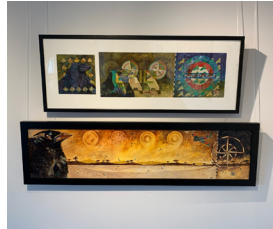
Four and Twenty Blackbirds - 2009 10" x 38" Watercolor on Paper