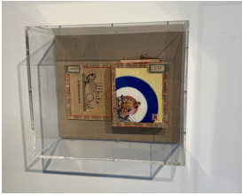
White Owl - 2019 14.25" x 6.25" x 12.25" Oil Paint and Wood - Mixed Media Plastic